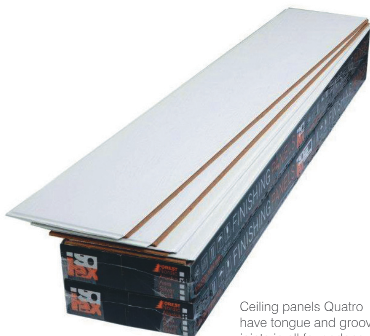
Ceiling panels Quatro have tongue and groove joints in all four edges

ISOTEX ceiling panels are soft board based products with decorative paper covering. ISOTEX is alternative decoration material to hardboard based panels to get more advantages.