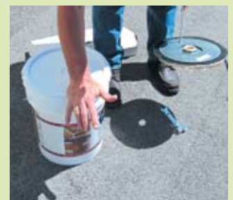
Replace the lid. Make sure that it is tight on the pail