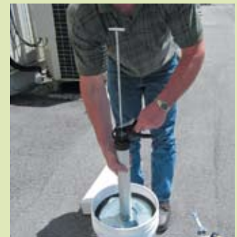
Ensure the tight seal, fully extend rod and fill the barrel. Disengage from the follow plate