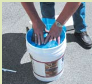
Replace plastic liner over the surface of the sealant