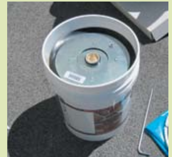
Place the follow plate on top of the chinking pail