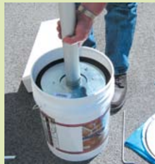
Remove the cap and cone tip from the gun barrel and push the end of the barrel onto the hole