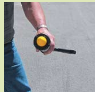
Attach the end cap and cone tip to the end of the barrel