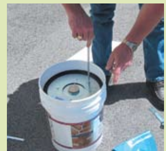
Insert the handle rod into the open nut to remove the follow plate