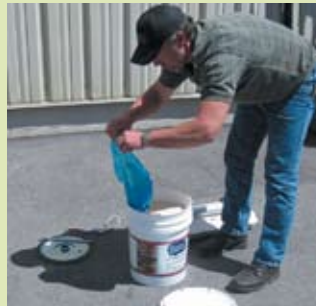
Remove the lid and the plastic liner from the pail